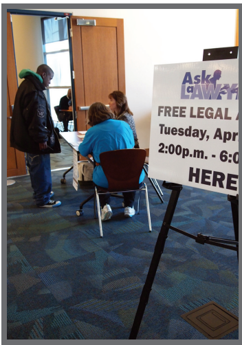
A gentleman seeking legal advice checks in at the Ask a Lawyer registration desk at the Indianapolis Central Library Ask a Lawyer location.

The Indianapolis Bar Association is committed to providing pro bono services that benefit the residents of Indianapolis. Within this Annual Report you will find information on the IndyBar's different pro bono programs as well as information about those who have benefited from the services. We look forward to continued partnerships with attorneys, nonprofit organizations and the residents of Indianapolis in order to ensure equal access to justice for everyone in Indianapolis.